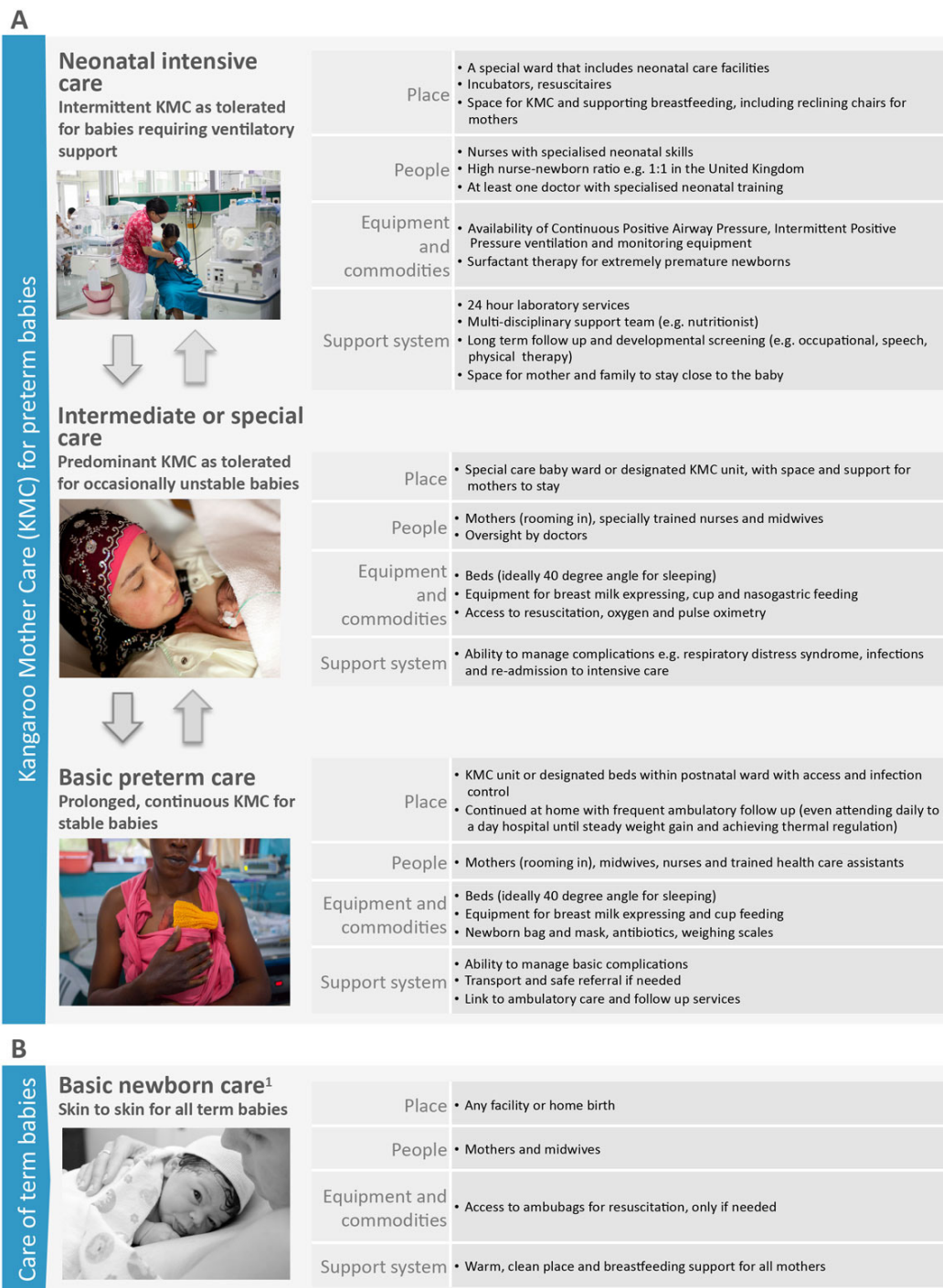
Figure 1 Kangaroo Mother Care, showing health systems requirements by level of care. Any items available at the basic level should be available at the higher level. For more details of special care and neonatal intensive care requirements see Moxon et al. paper on inpatient care of small and sick newborns in this supplement. KMC: Kangaroo Mother Care. Part A: Kangaroo mother care for preterm babies. Part B: Care of term babies. 1 KMC is not the same as skin-to-skin care alone. KMC involves continuous prolonged skin-to-skin contact with the infant placed on top of the mother's chest in a prone vertical position (Kangaroo Position), support for breastmilk feeding and a supportive environment. Neonatal intensive care image source: Syane Luntungan/Jhpiego. Intermediate or special care image source: ©EFCNI. Basic preterm care image source: Save the Children. Basic newborn care image source: Joyce Godwin.