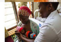
Figure 4 Overcoming socio-cultural barriers to the scale-up of kangaroo mother care and preterm care. Both caregivers and providers may have barriers to the uptake of KMC. Local context must be taken into account to understand and overcome these barriers. Based on literature and programme experience of the authorship team, we summarise some of the common barriers faced and enablers found. KMC: kangaroo mother care.

Risk of losing power or finances: In for-profit systems, KMC might be less favoured in contrast to neonatal intensive care unit admissions, which result in greater income generation for facilities. Conversely, KMC follow-up in private practice has the potential to become a source of income for providers previously resisting it. Other enablers for providers have to do with the ability to disseminate scientific evidence of the impact of KMC, particularly to gain recognition and endorsement by those perceived to be in authority.