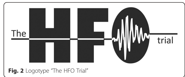
Fig. 2 Logotype “The HFO Trial”

Subjects are replaced if they withdraw from the study during follow-up before the first preliminary outcome determination at 6–8 weeks. Subjects who are withdrawn