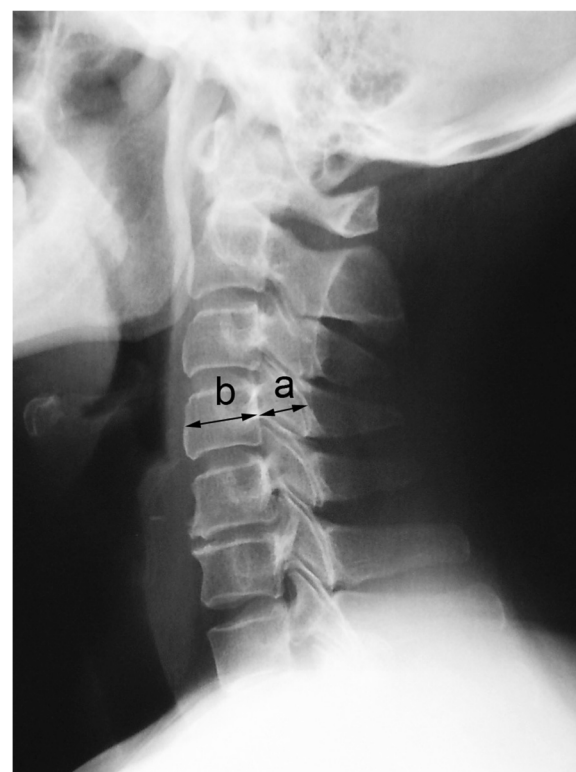
Fig. 1 Determination of Pavlov's ratio. The anteroposterior diameter of the cervical canal a is measured from the middle portion of the posterior cortical surface of the vertebral body to the innermost cortical surface of the respective lamina. The anteroposterior diameter of the vertebral body b is measured at the midpoint between the anterior surface and the posterior surface. Pavlov's ratio is determined with the formula a/b . The normal ratio is approximately 1.00

The X-ray beam was focused at C5, and radiographs were all taken at a film-focus distance of 1.5 m. The anteroposterior (AP) diameters of the cervical canal were measured on lateral radiographs between the middle portion of the posterior cortical surface of the vertebral body and the innermost cortical surface of the respective lamina at each vertebral level in neutral position. The sagittal diameter of the vertebral body was measured at the midpoint between the anterior and posterior surfaces. Pavlov's ratio, which is unaffected by magnification error, was calculated as the sagittal diameter of the cervical canal divided by the sagittal diameter of the vertebral body (Fig. 1). A value of < 0.82 at one level at least indicated DCS [4], and on this basis the 122 patients in this study were classified into two groups: a DCS group and a non-DCS group. The Cobb angle, which was measured between intersecting lines drawn perpendicular to the bottom of the C2 vertebral body and that of the C7 or C6 body on lateral radiographs, was used to evaluate cervical lordosis. Cobb angles of > 10^\circ , 0\text{--}10^\circ , and < 0^\circ were judged to be lordotic, straight, and kyphotic,