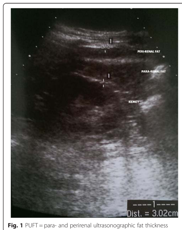
Fig. 1 PUFT = para- and perirenal ultrasonographic fat thickness

Results are expressed as mean \pm standard deviation. To test the significant independent relationship between PUFT or 24-h mean diastolic blood pressure and anthropometric, hormone and metabolic parameters we determined Pearson correlation coefficient, since all the data were normally distributed. Furthermore, to test the independent relationship between 24-h mean DBP and the other examined parameters we constructed multivariate models by multiple linear regression analysis based on 24-h mean diastolic blood pressure (dependent variable) and significant variables by univariate analysis; clinically significant variables were forced in the models if