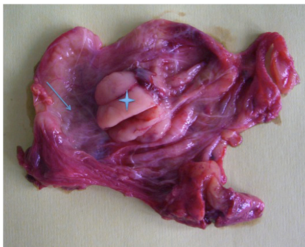
Figure 2 Gross examination showed a unilocular cystic mass (arrow) with some thymic lobules (star).

A complete thymectomy with resection of the mediastinal fat was performed. Gross examination showed a cystic mass of 7 cm, thin-walled with brownish liquid content (Figure 2). Microscopic examination showed a cyst wall lined by a flattened and unistratified epithelial lining overcoming thymic residues (Figure 3). Many Hassall's corpuscles – sometimes calcified – were observed. Thymic parenchyma seemed hyperplastic with conservation of the corticomedullary differentiation with the presence of many Hassall's corpuscles (Figure 3). An immunohistochemical study using the terminal deoxynucleotidyl transferase and cytokeratin antibodies was performed in order to rule out the diagnosis of thymoma. In fact, thymoma is characterized by the presence of two components: an epithelial one assessed by cytokeratin antibody and an immature inflammatory one highlighted by the deoxynucleotidyl antibody. We did not observe lymphoid