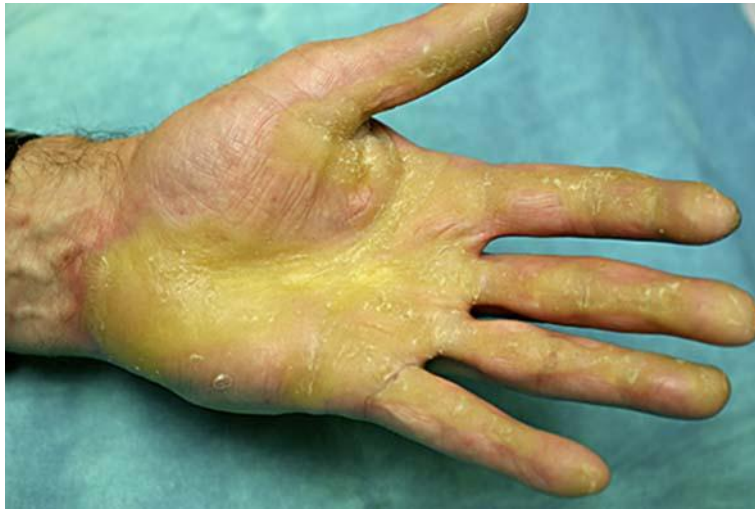
Fig. 4. Healing of fissures and reduction of the hyperkeratosis after 6 months of treatment with acitretin 20 mg daily.