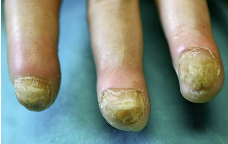
Fig. 2. Thickened and friable nails with increased longitudinal and transverse curvatures.