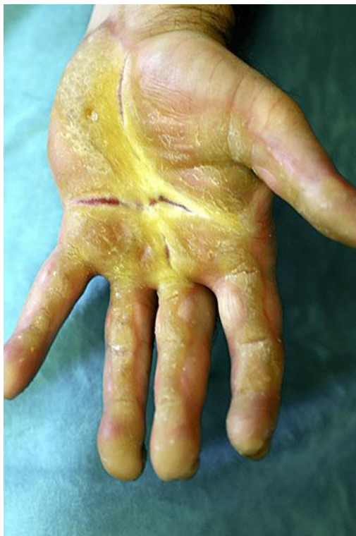
Fig. 1. Severe and fissured palmar keratoderma with a wavy, linear pattern on the volar aspect of the fingers.