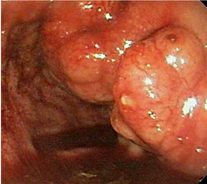
Fig. 1. Upper endoscopy picture showing bleeding giant varices in the rectum.

Sakib et al.: Potential Pitfalls in Transjugular Portosystemic Shunt Placement for Bleeding Rectal Varices