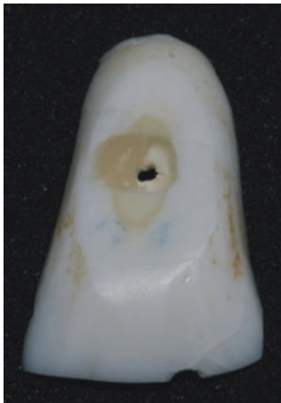
FIGURE 3: Illustration of mixed failure mode.

failure showed a high prevalence of adhesive failure for all the composites tested.