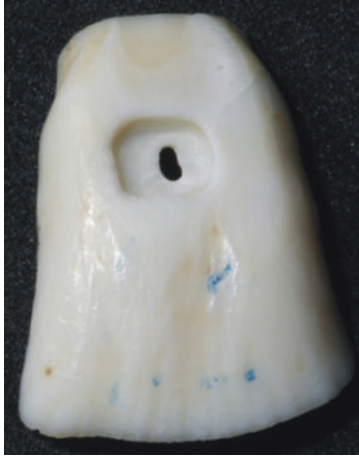
FIGURE 2: Illustration of adhesive failure mode.