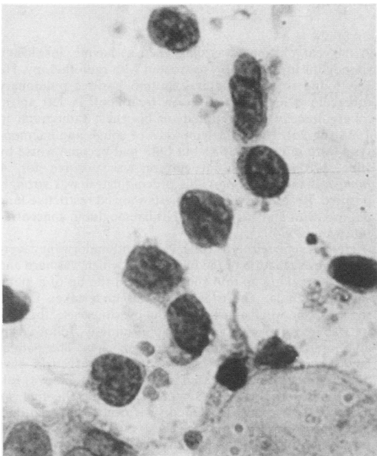
Fig 2 Case 2: Sputum showing single lymphoma cells. ( \times 485 .)

The morphological features of the lymphoid cells seen on