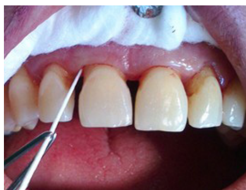
Figure 2. Microbiological samples were taken from the deepest pocket in each quadrant. The procedure was performed with a sterile paper point which was inserted in the bottom of the pocket for 20 seconds, after isolating the selected sites using cotton rolls.

The means and standard deviations were computed for all clinical and microbial variables of each treatment group. The data were processed using statistical software (SPSS 16.0, IBM, Chicago, IL). Kolmogorov–Smirnov test was used to confirm the normal distribution of the data. Kruskal-Wallis test was opted for multiple comparisons of the nonparametric data (PPD reduction, CAL gain, PI and PBI) between groups. In addition, Mann-Whitney test was applied to compare the groups. Friedman and complementary Wilcoxon signed-ranks test were applied to determine the differences in the means of clinical parameters for the baseline, 6 weeks and 3 months. One-way analysis of variance (ANOVA) was used in order to compare the microbial variables between the groups after