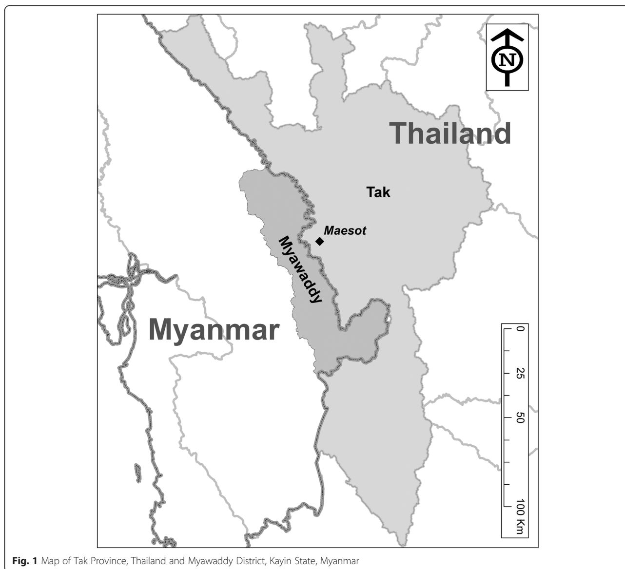
Fig. 1 Map of Tak Province, Thailand and Myawaddy District, Kayin State, Myanmar

Interviews were tape-recorded after the participant gave written informed consent.