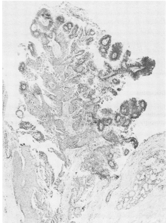
Fig 1 Benign papilloma of the trachea, covered by a mixture of transitional and respiratory type epithelium. (Haematoxylin and eosin, × 30.)

Sections of the main tumour and of the secondary deposits showed a well differentiated squamous carcinoma (fig 2).