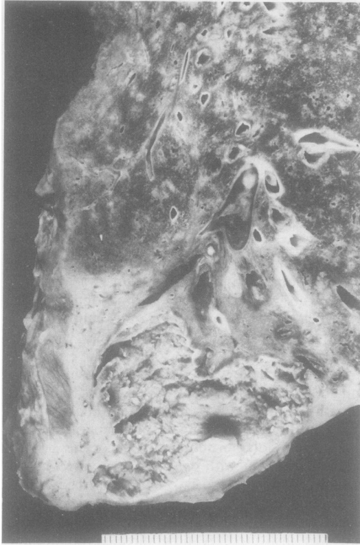
Fig 2 Patient 4: An abscess is present within the lower lobe infarct at the bottom of the photograph. Note a large occlusive thromboembolus in the artery at the apex of the lesion. The pleura bordering the cavity is necrotic. Pale areas above the infarct are foci of bronchopneumonia. (Scale in mm.)

the left upper lobe. Focal disruption of the pleura was observed microscopically. A thromboembolus was seen in the segmental artery proximal to the lesion, and multiple other microthromboemboli were observed bilaterally. The wall of the cavity and the surrounding necrotic parenchyma were heavily colonised with bacteria and yeast.