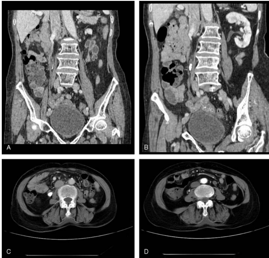
FIGURE 1. Case 1. (A,B) MPR and (C,D) transverse scanning images display ureterostenosis of the right ureter at the level of the lower margin of the 4th lumbar vertebral body. (B,C) Dense stones and ureterectasia found at and above the place of ureterostenosis, respectively. (C,D) Dilated circuitous ovarian vein nearby that crosses over the ureter is displayed (white arrow indicates the ureter and black arrow indicates the ovarian vein). MPR = multiple planar reconstruction.

began at the feet, and the scanning covered the area from the renal upper pole to the pelvic floor. Both plain CT scans and enhanced CT scans (including arterial phase, venous phase, and secretory phase) were performed for all patients. CT number monitoring scanning was used for the arterial phase, followed by the venous phase scanning after an interval of 30 seconds. After another interval of 7–10 minutes, the secretory phase scanning, which covered the area from the lower pole of the 11th thoracic vertebra to the pelvic cavity, was performed. A total of 80–100 mL of Ultravist (300 mgI/mL) (Bayer Schering Pharma AG, Berlin, Germany) was used as the contrast agent, which was injected with the velocity of 2.5–3 mL/second. A GE ADW4.5 workstation (General Electric Company) was used for the post-processing of the images, particularly the multiple planar reconstruction (MPR) and curved plane reconstruction (CPR) of the venous phase images.