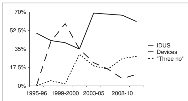
FIGURE 2. Epidemiological trends of isolated RSIE. IDUs = intravenous drug users, RSIE = right-sided infective endocarditis.

Tricuspid valve is the most frequently affected valve (92%) followed by the pulmonary valve (8%). Two episodes were multivalvular. The infection was poorly controlled in many patients, as almost 50% of patients have persistent infection. Septic shock was the main cause of death in this group. Their immunosuppressive state and the low percentage