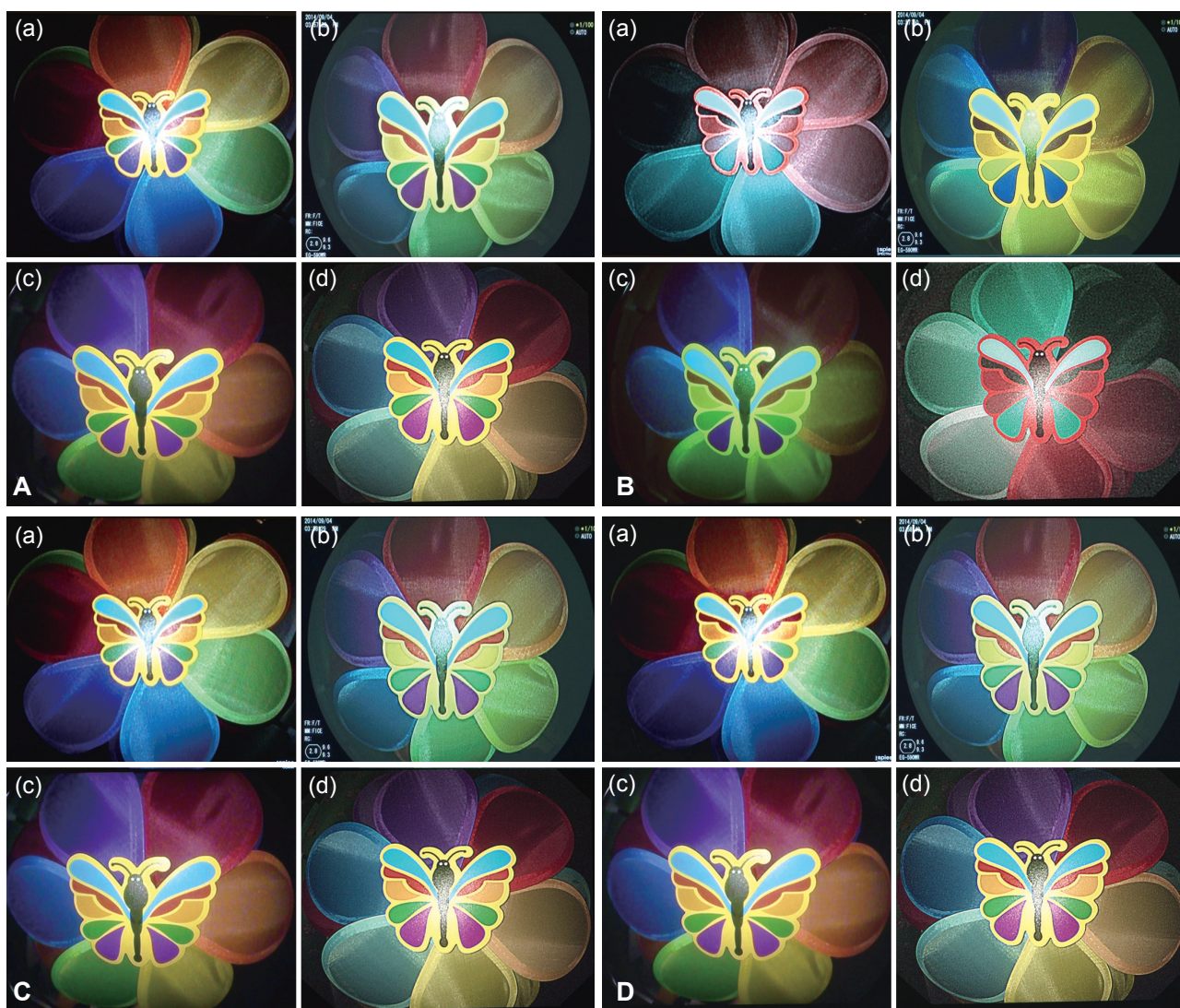
Fig. 1. Butterfly pattern ( in vitro ) taken according to each endoscopy company, analyzed on each point of evaluation, namely (A) definition, (B) boundary, (C) brightness, and (D) light and shade.

images have a low resolution, the light absorbed by the CCD is composited into RGB to generate color images. 6 I-scan technology is the newly-developed image-enhanced endoscopic technology from Pentax. It consists of three types of algorithms: surface enhancement (SE), contrast enhancement (CE), and tone enhancement (TE). SE improves light/dark contrast and allows for detailed observation of the mucosal surface structure. CE adds blue color in relatively dark areas and allows one to distinguish subtle irregularities around the mucosal surface. With TE, the RGB components of an ordinary endoscopic image are disintegrated into each component, followed by a re-synthesis to yield a reconstructed image. In the Olympus system, NBI is an optical-filter technology that uses two narrow-band filters to provide tissue illumination in the blue and green light spectra. 7 Color management technology has progressed a great deal, yet there remains a limitation in