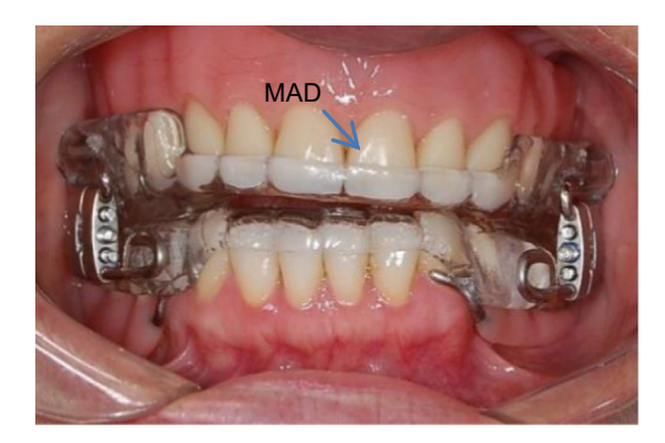
Fig. 2 - Patient with dentures and MAD installed.

Treatment of edentulous patients with mild OSA is normally limited to CPAP or tongue retainers, which have low compliance [5,11]. The prevalence of OSA increases with age [2], and the prevalence of edentulous individuals is also high in the elderly population [8]. Using a MAD on a prosthesis is an alternative, as it is a low-cost treatment and does not require a power source [4].