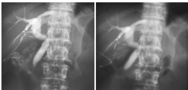
Figure 2 A ureteral catheter was pulled out without bile leakage. The cystic duct was closed with the Lapro-Clip.

Postoperative complications occurred in 6 patients (11.5%) (Table 3). Following T-tube removal, three patients had significant bile leakage (5.8%). Two patients developed severe abdominal pain, sweating and tachycardia and were diagnosed as localized bile collection. They were treated with antibiotics, parental fluids, analgesia, and the drain tube was reinserted through T-tube sinus tract. Recovery was achieved with this management. The third patient developed biliary peritonitis and required open drainage.