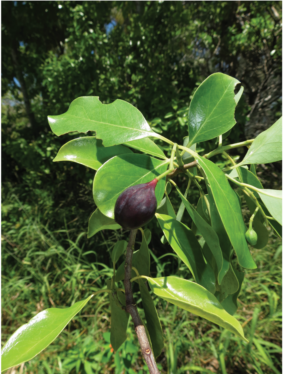
Figure 3. Fruit of Santalum austrocaledonicum var. glabrum on Ouvéa atoll in January 2015 (specimen Butaud 3414).