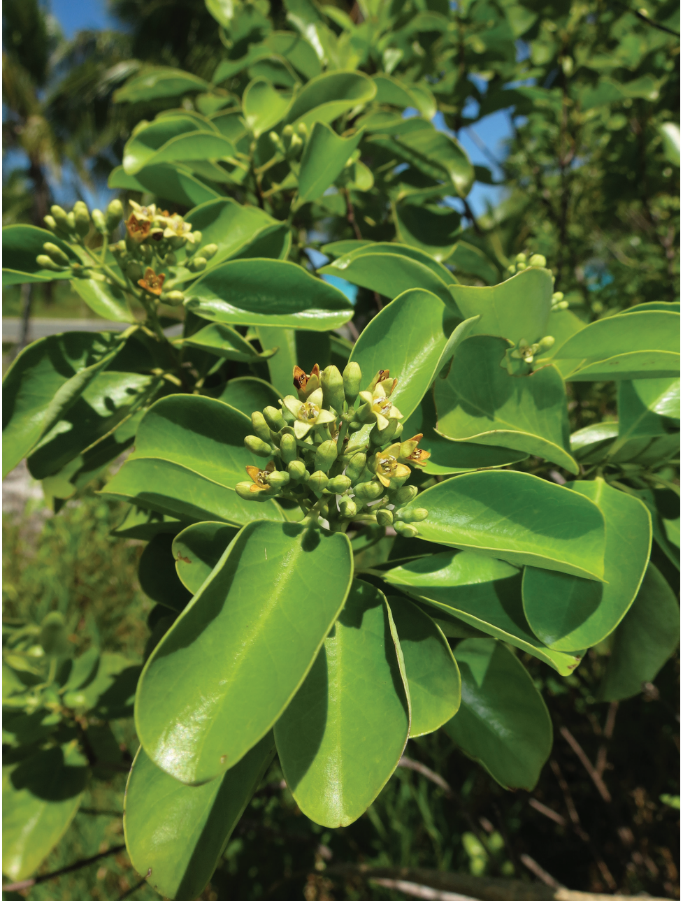
Figure 2. Flowers of Santalum austrocaledonicum var. glabrum on Ouvéa atoll in January 2015 (specimen Butaud 3414).