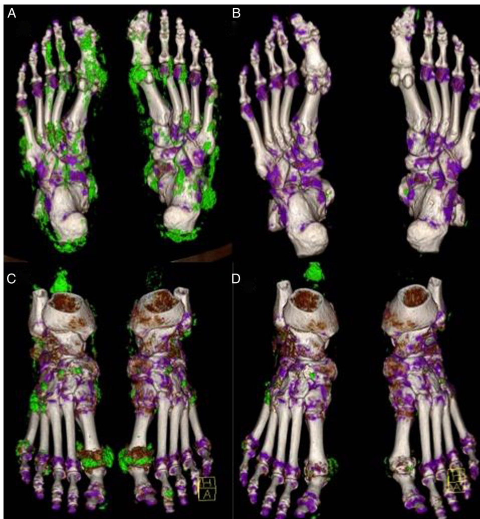
Figure 2 Resolution of tophi after exposure to pegloticase. Three-dimensional dual-energy CT images from a chronic tophaceous gout patient responding to pegloticase (A and B) and from a patient showing partial response (C and D). Multiple tophi can be found in the feet (A and C) prior to pegloticase treatment (green pixels). Images obtained after treatment showing almost complete resolution of deposits in the feet of the responder patient (B) and significant reduction in the feet of the partial responder (D).

vivo. Our data suggest that even large tophi can resolve when patients are exposed to highly potent uric acid-lowering therapy. DECT technology is an excellent tool to comprehensively assess tophus burden and to longitudinally monitor treatment response. The data also suggest that a ‘tophus-free’ state may become a measurable and reachable treatment target even in patients with severe manifestations of gout when effective treatments such as pegloticase are used. Recent insights in the prediction of infusion reactions to pegloticase will further improve the safety of its use in patients with severe gout. 18