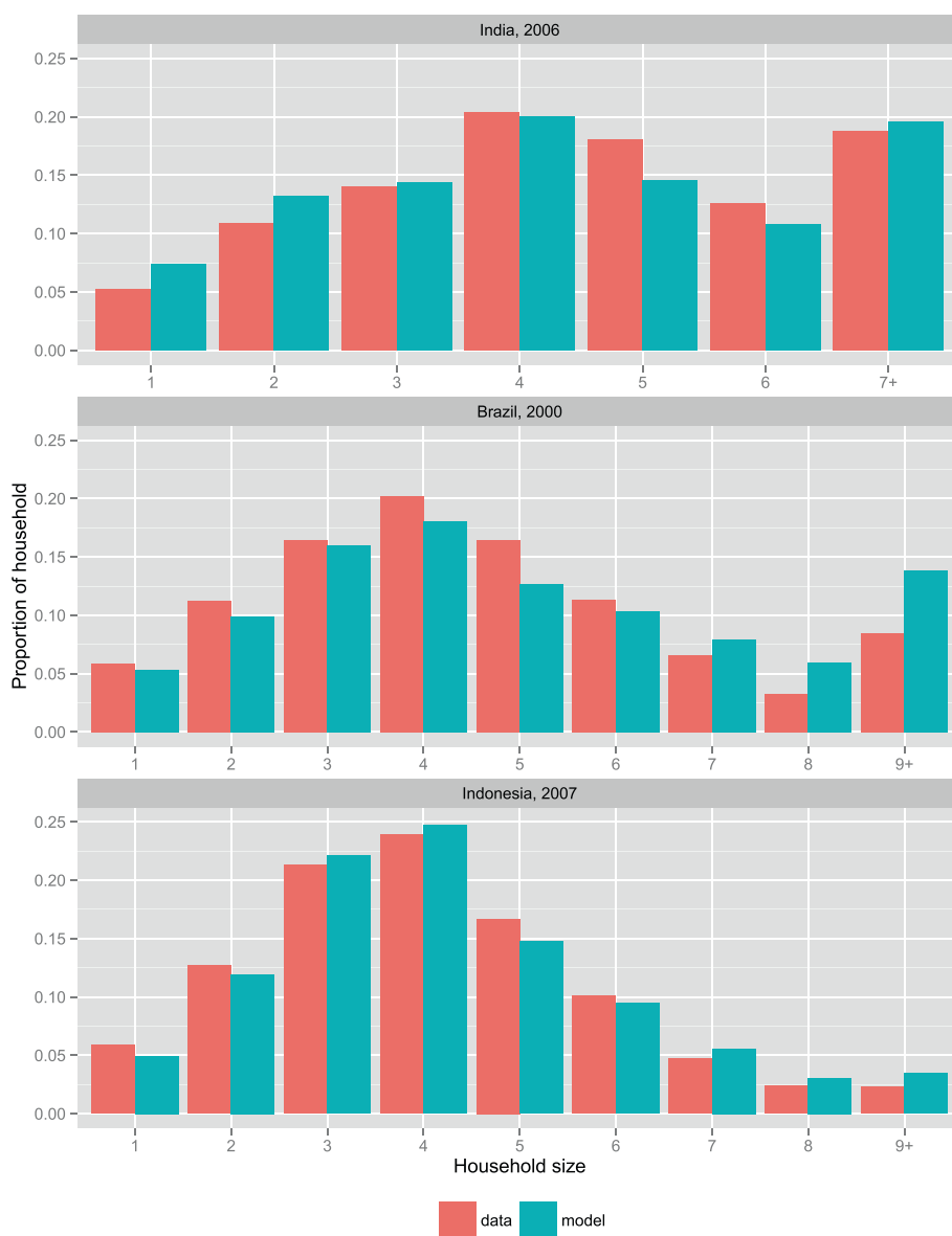
Fig. 1 Result of calibration of the household structure in the population to the observed distribution of household size in India (2006), Brazil (2000), and Indonesia (2007). There is no significant difference between data and the simulated distributions ( \chi^2 -test)

Indonesia), and 0.235 (95 % CI: 0.194-0.276; Madura). Figure 2 shows that in all scenarios our model was able to reproduce the observed trends. Madura shows a poor fit for the years 2001–2003, given the operational changes in leprosy control that were considered at national level. Also the simulated MB proportion in each country matched the proportion in data (See Additional file 1: Figure S2).