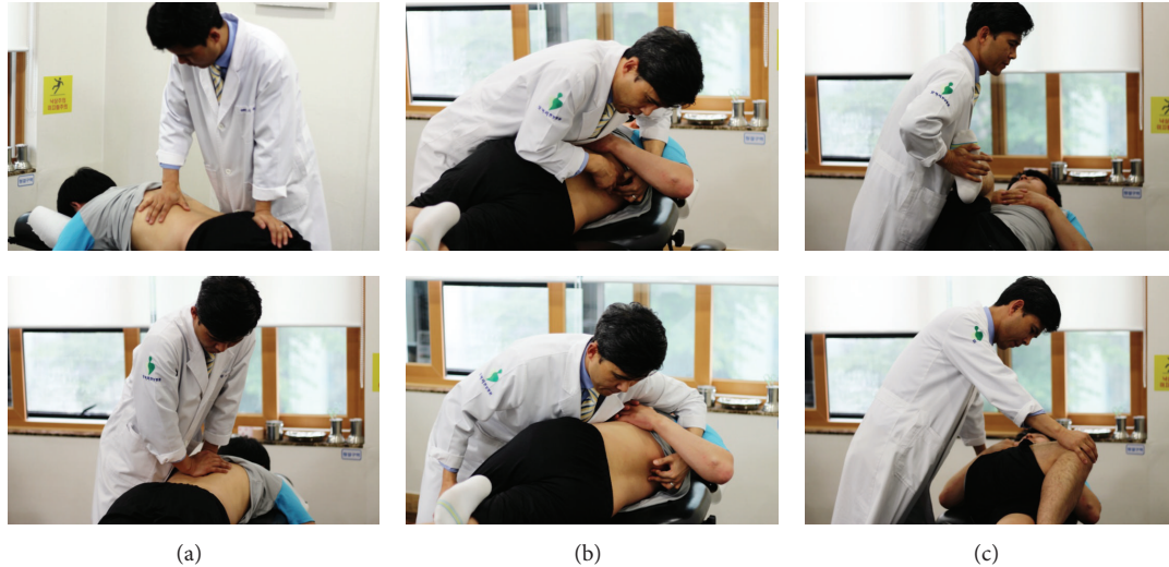
FIGURE 1: The Chuna procedure (Korean-style manual therapy). (a) Extension-mobilization technique of lumbar vertebrae. (b) Manipulation technique of lumbar vertebrae in the lateral recumbent position. (c) Relaxation technique for lumbar vertebrae and the hip joints.

should be established. Observational studies including case studies and case series cannot provide conclusive evidence, but they play a complementary role to randomized controlled trials (RCTs). If no RCTs are available, case series can provide the best information with which practitioners and policy makers can make health care decisions [10]. The objective of this retrospective case series was to summarize the results of KM treatment of LSS in a local Korean hospital and provide basic evidence supporting its use and a clear outline of the proper procedures.