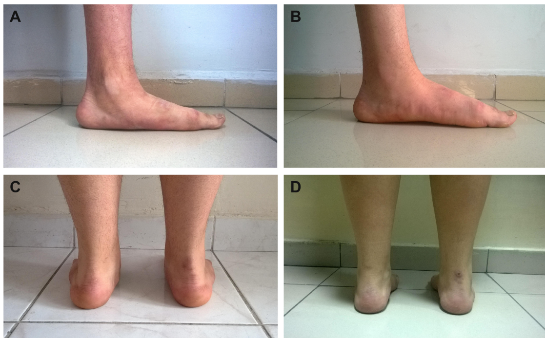
Figure 2 Preoperative and postoperative images of the patients in standing foot posture. Notes: Change from baseline in (A, B) the foot arch in a patient, and (C, D) heel valgus in another patient.

removal, if required. 4,15 Complete and painless range of motion of the subtalar joint can also be achieved after implant removal. 15