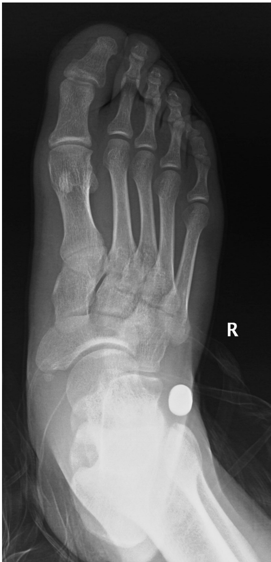
Figure 3 Anteroposterior X-ray showing fixation failure of the subtalar implant at 7 months postoperatively.