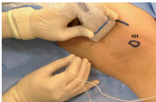
Figure 1 - Simulation of ultrasound probe and needle position for in-plane intercostobrachial nerve block technique. Midpoint on the skin covering the medial aspect of the humeral head (HH). The curved line denotes the lateral border of the pectoralis major.