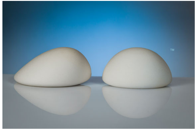
Figure 2. Round and anatomical B-Lite® Lightweight Breast Implants (LWBIs). The current B-Lite® catalogue includes over 350 styles and sizes.

Since their introduction, saline and silicone breast implant volume and weight have been synonymous (specific gravity: 1.0 g/mL and 0.97 g/mL, respectively). Recognition of the weight-dependent impact of mechanical forces on breast tissue integrity has prompted the design of the novel, fifth-generation form-stable, silicone gel B-Lite® Lightweight Breast Implant (LWBI) (G&G Biotechnology Ltd., Haifa, Israel). The round or anatomical implant (Figure 2) contains