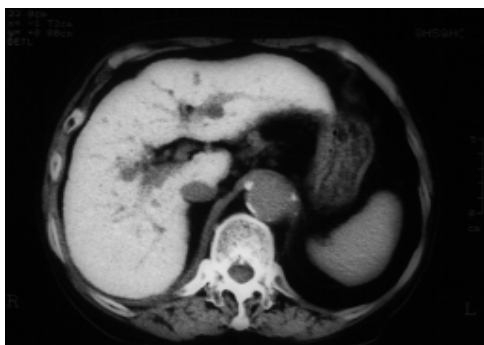
Figure 1 An unenhanced computed tomography (CT) scan of the upper abdomen. The liver has a greatly increased density (111.8 HU).