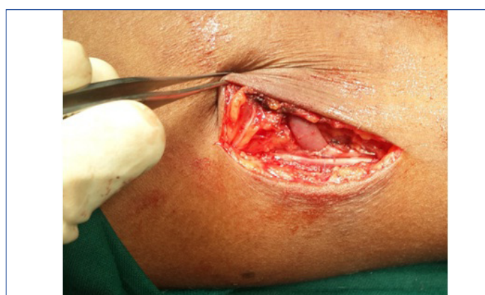
[Table/Fig-4]: Brachio-cephalic fistula-End to side anastomosis

primary failure (p-value - 0.01). Secondary failure due to thrombosis occurred in 3 (10%) patients. One patient had her AVF recanalised after intravenous heparin. AVF failure occurred more commonly in distal fistulas (76.92%, p-value < 0.05) in our series. Patients older than 60 years (p-value < 0.05) had more fistula failures compared to young patients.