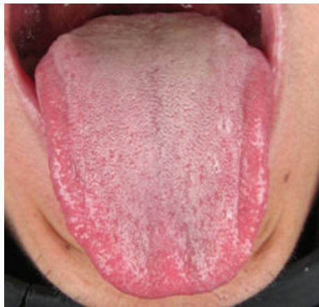
FIGURE 1: Sampling images of tongue coating from the center of the tongue, an area regarded as tongue coating in the traditional tongue diagnosis.

to 240°C, 10°C/min increased to 280°C, and it was held for 10 min. Injection inlet temperature was 280°C and sensor temperature was 300°C. The carrier gas is Helium and flow rate was 1 mL/min. MS condition is as follows: EI ionization, electron energy 70 eV, ion source temperature 250°C, interface temperature 250°C, solvent delay 5 min, full-spectral scan, and scan scope M/Z 40–600.