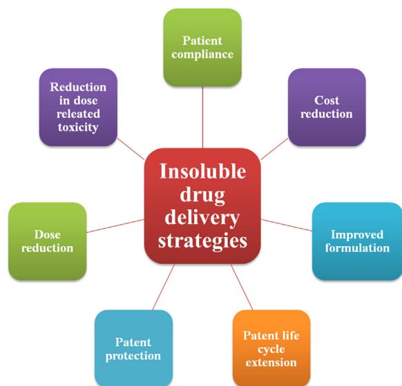
Figure 1 Benefits of insoluble drug delivery strategies.

Insoluble drugs are mostly formulated using the salt forms of weakly acid and basic drugs. Various salt forms of drugs have