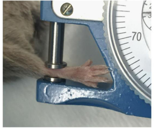
Figure 2. Paw Measurement

Measure front paws by placing the front paw in the caliper so the palm and back of paw touch either side of the caliper (A). Read measurement in mm. Measure the hind paws by placing the ankle joint in the caliper so either side of the ankle touches the caliper (B). Read measurement in mm.