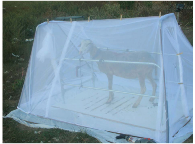
Fig. 2. Enclosure trap to capture host-seeking insects. The trap is open for an exposure period and then closed to allow feeding insects time to complete engorgement, after which insects are collected from the interior wall of the enclosure netting. (Online figure in color.)