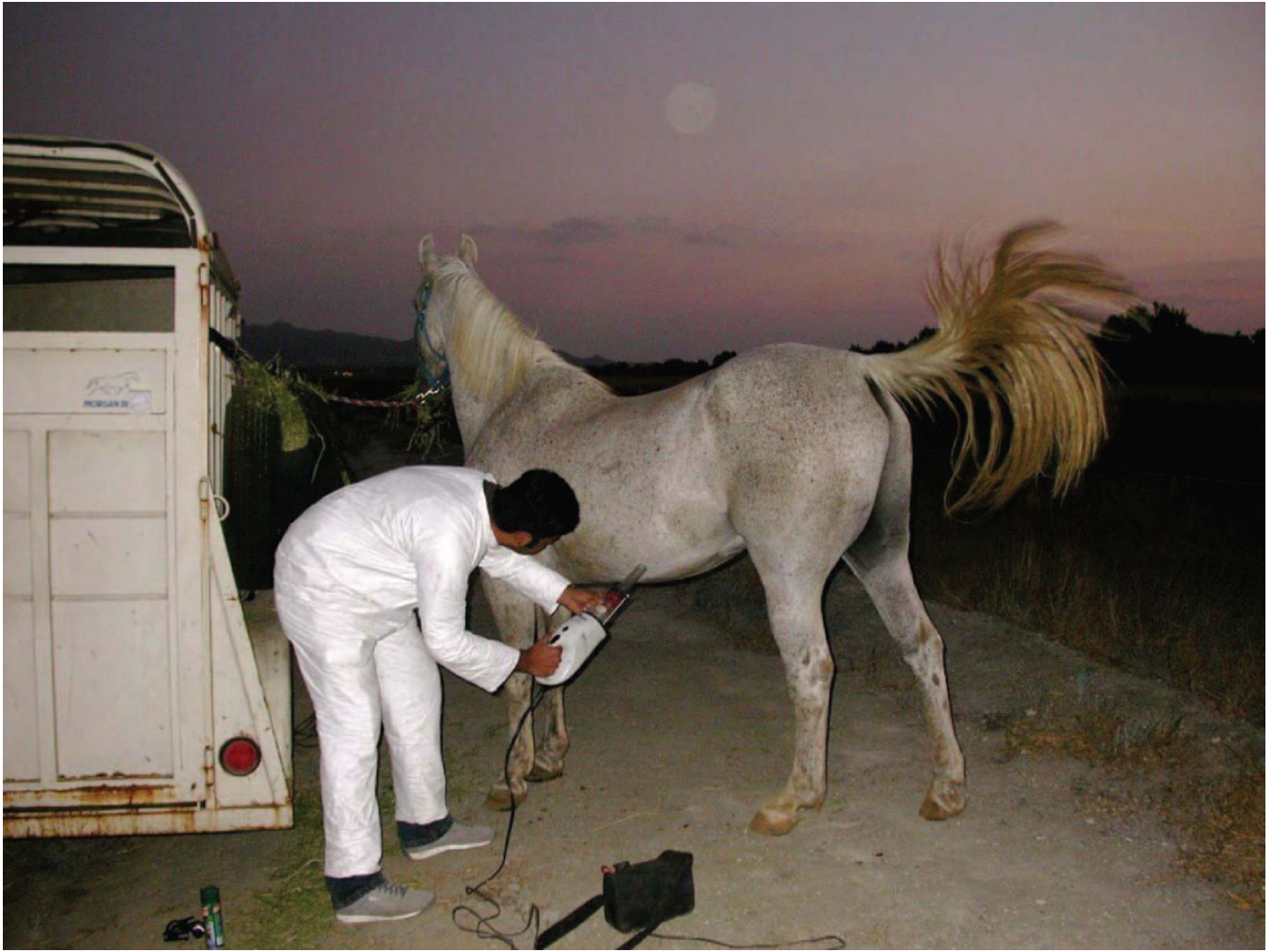
Fig. 3. Capture of blood-feeding insects by direct removal from the host using a mechanical aspirator. (Online figure in color.)