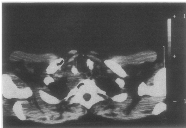
Figure 1 Computed tomography section of the upper thorax showing (arrowheads) a right paratracheal and retrotracheal extension of the tumour apparently affecting the right pulmonary sulcus. Note the presence of bilateral paratracheal calcific nodes primarily interpreted as old tuberculous lesions, though corresponding to metastases of a thyroid carcinoma.