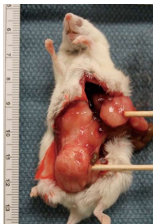
Figure 3 Showing the large orthotopic colon cancer tumor involving the surrounding structures (Lower marker). Also shown is the metastatic matted group of lymph nodes (Upper marker).