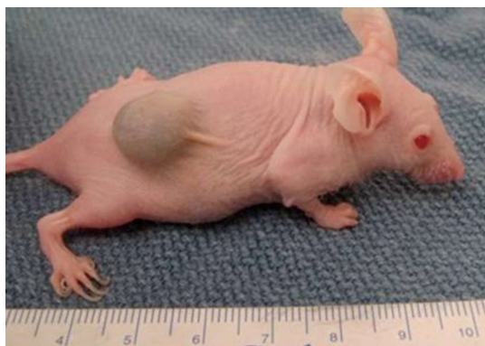
Figure 1 Showing a heterotopic colonic tumor on the flank of the mouse.

in detail, it is clear that there has been enormous development in the murine models over time. The latest models are more applicative with high tumor take rates, but still they have some limitations.