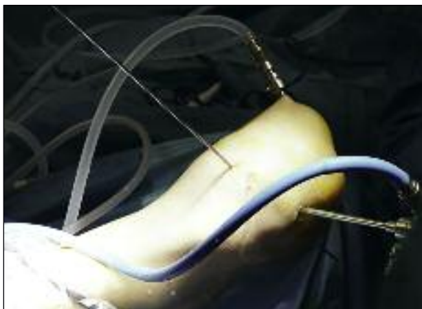
Fig. 4. A Beath pin is placed in the anatomical insertion of the posterolateral bundle of the ACL and directed through the lateral aspect of the thigh. The pin will be loaded with a passing suture.

Surgery was performed arthroscopically in all cases. The preparation of the graft required between 10 and 15 minutes to complete and was performed as described previously; minor trimming of the device was performed to obtain the final sizing and address surgeon preferences. The graft preparation was faster and easier than experienced with conventional allograft tendons.