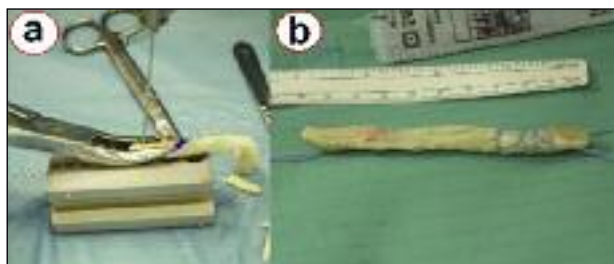
Fig. 3. The xenograft requires only minimal preparation: two holes are drilled in the bone plugs in order to allow the placement of two passing sutures (a), while the part of the tendon that should be placed in the tibial tunnel is whipstitched to improve screw purchase and minimize graft damage during screw insertion (b).

At the end of the procedure, drain suction is placed and the skin is closed. Rehabilitation and return to sporting activity did not substantially differ from what is seen with standard ACL reconstruction protocols.