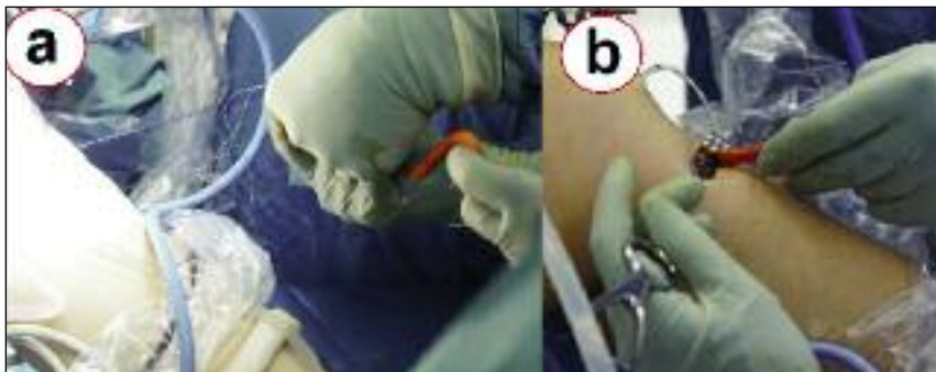
Fig. 5. The looped suture that exits from the tibial tunnel is loaded with the suture placed in the xenograft femoral bone plug (a). Therefore, pulling the suture that exits from the femoral tunnel allows the graft to be passed into the tibial tunnel (b), the knee joint, and finally the femoral tunnel.

During the graft preparation the tendon and bone quality was found to be much better than that seen with allografts. The whole surgical procedure took less than 60 minutes. Two patients underwent concomitant meniscectomy (1 medial and 1 lateral) while one patient underwent a lateral meniscus suture repair for a posterior horn tear.