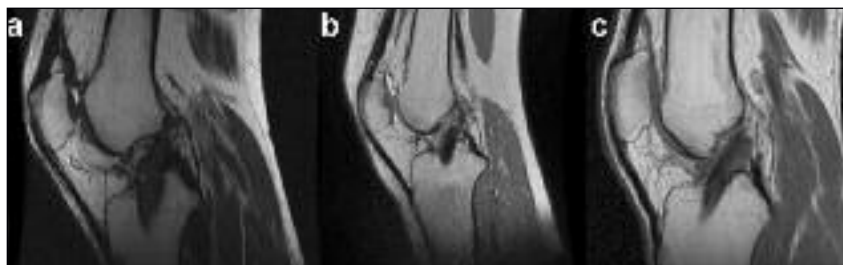
Fig. 6. Two-year follow-up MRI of the three patients that received the Z-Lig® device. MRI signal show good status of the graft, with no signs of inflammatory process.

This finding was consistent with an initial elevation followed by a return to baseline over the 24-month period, and it confirmed the safety profile of the device as suggested in the preclinical animal models and pilot human clinical safety study.