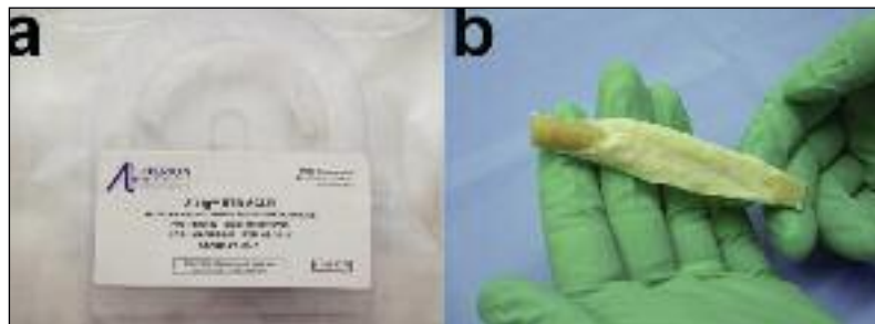
Fig. 2. The Z-Lig ® device is provided already shaped, sized and ready for implantation, sealed in a sterile package.