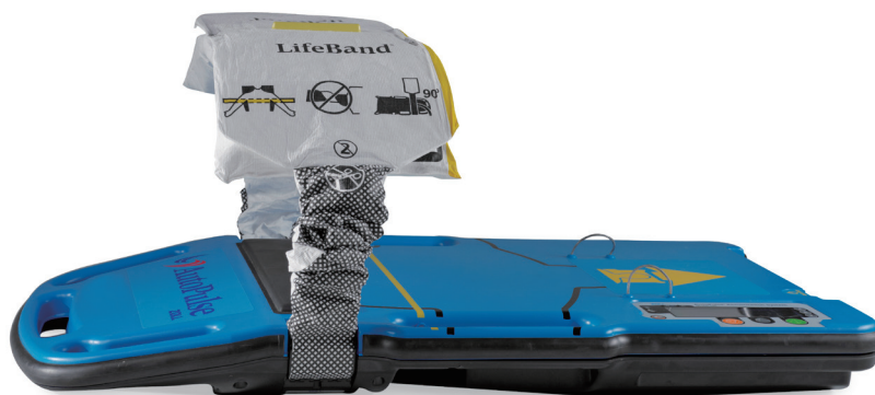
Figure 2 Zoll AutoPulse. Chest compressions are given by the load distributing band.