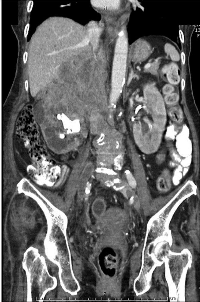
Fig. 3. A coronal section of computed tomography of the abdomen demonstrated an infiltrative tumor with extensive involvement of the right kidney, the right pelvocalyceal system, the right adrenal gland, the right lobe of the liver and the adjacent right hemidiaphragm and psoas muscle.