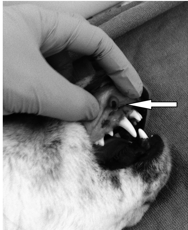
Fig. 1. L. nilotica gum of male stray dog (white arrow).

The extraordinary finding of L. nilotica in a stray dog in Italy suggests that any infestations in wild and domestic mammals, including humans, may be possible. For this reason, during the veterinary examination, Hirudinea ectoparasites should be included in the differential diagnoses for unexplained anemia, oral bleeding and caught in animals which may have been exposed to contaminated water not only in tropical regions but also in all areas where aquatic leeches are commonly found, included Italy. The animals may come in contact with leeches not only by drinking water, but also walking down the infested little rivers. Such route of transmission may also affect humans. Even though such water is not usually used for drinking, children often swim or play there. Therefore, a low but non negligible risk to become