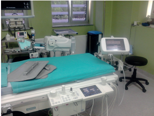
Figure 1. Automated contrast injector (UKC Sarajevo)

(CIN) and vascular complications in patients undergoing cardiac catheterization using traditional manual contrast injection techniques and automated contrast injector show that using automated contrast injectors resulted in a significant decrease in vascular and renal complications (7). The osmolarity of the contrast media plays an important role: the use of an low osmolarity contrast media reduces the risk of nephropathy in high-risk patients compared with the use of high osmolarity contrast media (8, 9).