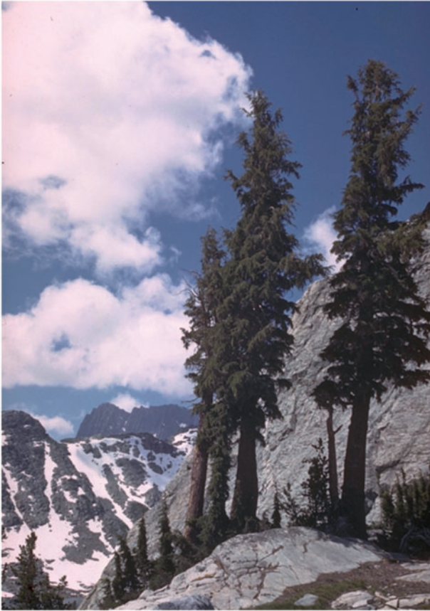
Fig. 2. ACC has driven an increase in precipitation in much of the more northerly latitudes (IPCC, 2014). This has, in turn, driven complex responses in wild plants. Mountain hemlock ( Tsuga mertensiana ) has shifted the centre of gravity of its distribution to lower elevations in California (a 255-m downwards elevational shift), in spite of an increase in mean annual temperature of 2.85 °C during the study period (1930s to 2000s). The observed downhill shift, while counter to expectations from warming, was in concert with a decline in water deficit of 134 mm over the past 70 years (Crimmins et al. , 2011).

these changes in distribution mirror changes in water availability, and so species were actually tracking geographic shifts in their climate niche over time, but that niche was driven mainly by water deficit rather than temperature (Fig. 2).