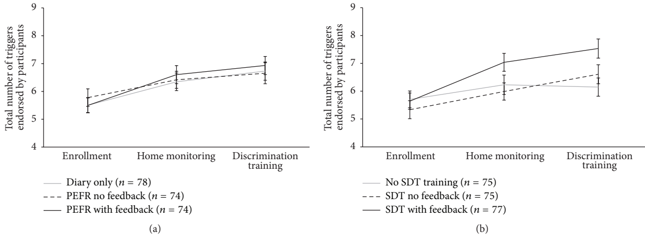
FIGURE 2: Total number of reported asthma triggers (mean \pm SEM) for each home monitoring condition (a) and for each resistive load signal detection training (SDT) condition (b) at enrollment, after home monitoring, and after discrimination training.

3.2. Change in Trigger Identification. The total number of triggers endorsed by children significantly increased over time ( F(2, 223) = 20.91, p < 0.001 ) both from enrollment to home monitoring ( t(223) = 4.72, p < 0.001 ) and from home monitoring to discrimination training ( t(222) = 2.90, p = 0.012 ) (Figure 2). The results of the covariate analyses demonstrated that greater numbers of new triggers were associated with lower SES ( F(1, 223) = 4.91, p = 0.028 ), longer duration of asthma ( F(1, 223) = 6.68, p = 0.01 ), and greater perceived asthma severity ( F(1, 223) = 20.77, p < 0.001 ), but not with participant age, sex, race, or lung function.