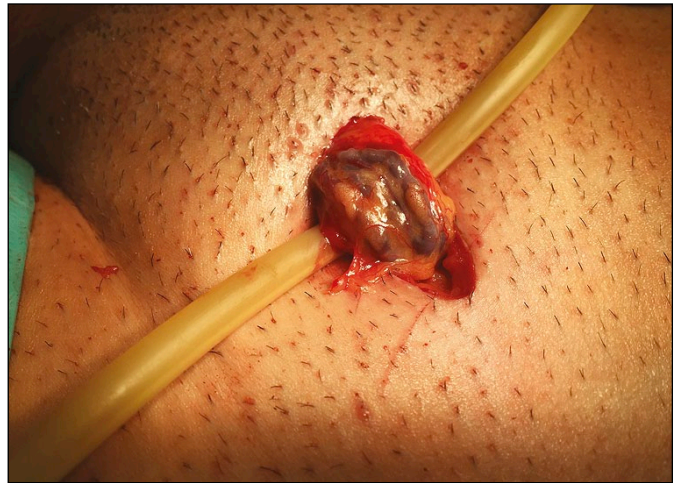
Figure 1. Microsurgical varicocelectomy. Spermatic cord delivered to the operative field just before introducing microscope (own material).

After 3 months, 26 cases (47.2%) of Group I and 11 cases (39.2%) of Group II had improvement in semen quality. After 6 months, there was an improvement in the semen quality in 32 cases (58.2%) in Group I and in 15 cases in Group II (53.5%). According to this data laparoscopic varicocelectomy in older men can achieve improvement in semen quality comparable to relatively younger patients. Zini [31] compared 115 men aged 40 years and older and 466 men younger than 40 years with clinical varicocele and infertility. All patients underwent microscopic varicocelectomy done by the same surgeon. There were no significant differences in the baseline sperm parameters and in spontaneous pregnancy rates after varicocelectomy in couples with advanced