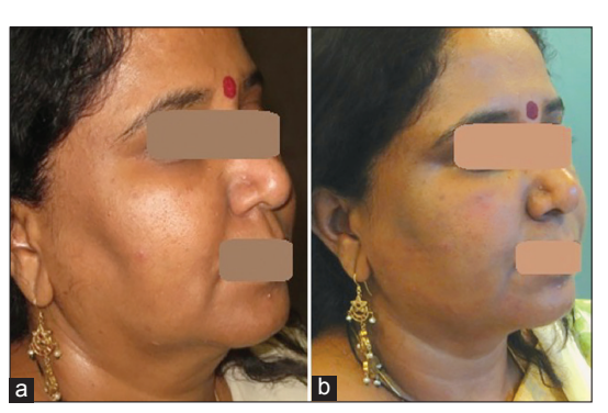
Figure 3: Example of a female subject in the late age group (a) Before treatment and (b) After treatment