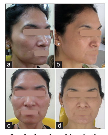
Figure 2: Example of a female subject in the mid-age group (a) Before treatment and (b) After treatment; (c) Before treatment and (d) After treatment