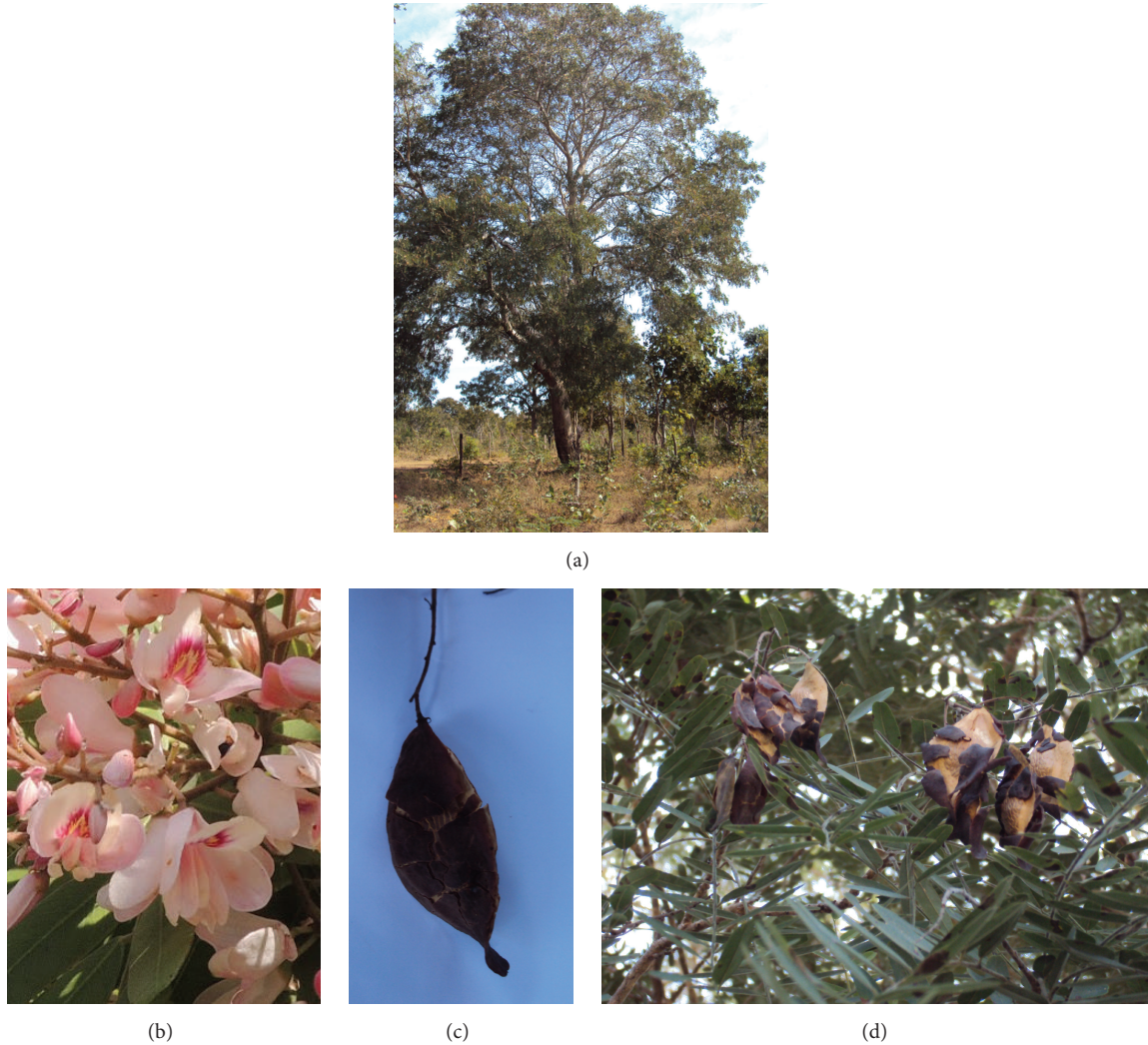
FIGURE 1: Photographs of the Pterodon pubescens tree in habitat (a), flowers (b), fruit (c), and a fruiting branch (d).

which may indicate that certain soil characteristics are a limiting factor in the plants' development [19]. In general, these species are aromatic, native trees growing 6–18 m tall, and are distributed throughout the central region of Brazil, especially in the Cerrado (Goiás, Minas Gerais, São Paulo, Tocantins, Mato Grosso, and Mato Grosso do Sul) and the semideciduous forest of the Paraná Basin [20, 21]. Despite their slow growth, Pterodon species are tolerant to direct sunlight and low soil fertility and are therefore important in mixed reforestation for the recovery of degraded areas [22].