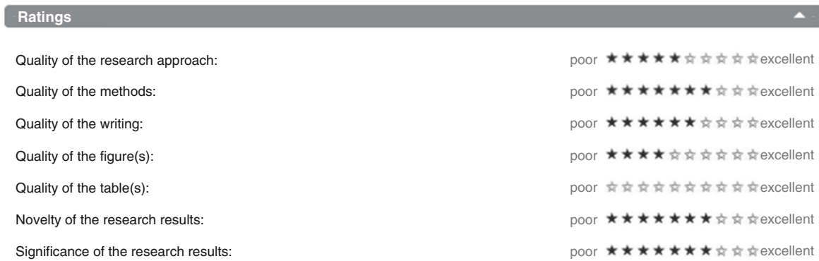
Figure 1. Summary scales used in the Frontiers review system.