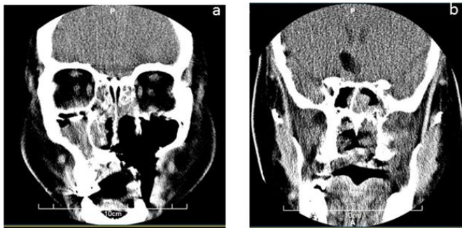
Figure 1. a: there is evidence of bone destruction and surgical resection in right maxillary sinus and right side palate; b: CT scan of face and paranasal sinuses, there is evidence of air fluid level in both maxillary sinus compatible with acute sinusitis. Mucosal thickening is also seen in ethmoidal and sphenoid sinuses.

CT scan of the paranasal sinuses (PNS) was performed. There was evidence of air fluid level in both maxillary sinuses compatible with acute sinusitis. Mucosal thickening was also seen in ethmoidal and sphenoid sinuses (figure 1). Brain magnetic resonance imaging (MRI) findings approved CT scan results, and pansinusitis and bilateral mastoiditis were seen, but there was no invasion to the brain vessels. Amphotericin B (1 mg/kg/day) was administered, and debridement of sinuses, ethmoidectomy, bilateral antrotomy, and resection of soft palate was performed using a video endoscopy. Histopathological findings and the results of culture confirmed our diagnosis. The isolate was identified as Rhizopus oryzae by sequence analysis (Gene Bank accession number is KJ577257). The dosage of amphotericin B changed to (1.5 mg/kg/day) and then to (3 mg/kg/day), and after two weeks, the patient was discharged from the hospital. After 4 months, there was no evidence of recurrence of infection.