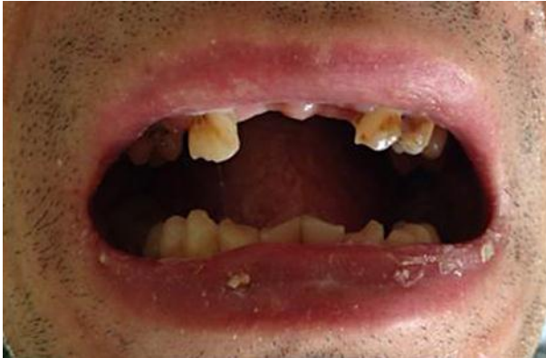
Fig. 3. Oral photograph. Ten teeth were extracted after initial surgery.

Fukuchi et al.: Descending Necrotizing Mediastinitis Treated with Tooth Extractions following Mediastinal and Cervical Drainage