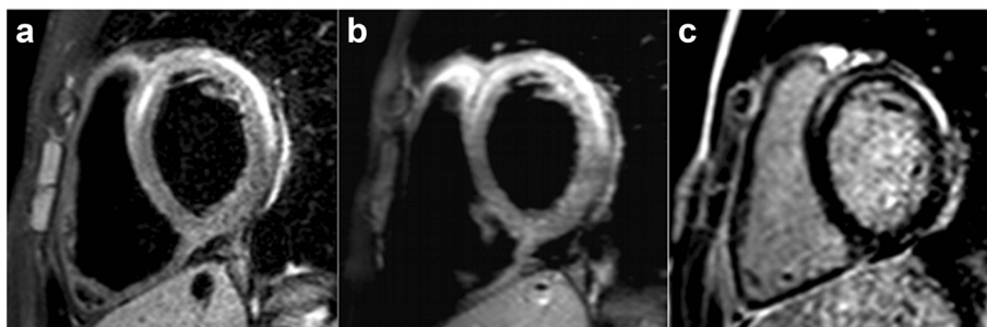
Fig. 1 Typical findings of myocarditis on CMR. 16-year-old patient with a midwall and subepicardial distribution of increased signal intensity in the left ventricle on T2-weighted (a), T1-weighted early gadolinium enhancement (b), and late gadolinium enhancement (c) imaging

included larger LV end-diastolic volume (median 110 ml/m 2 vs. 86 ml/m 2 , p = 0.02 ), lower LV ejection fraction (median 40 % vs. 58 %, p = 0.003 ), and lower RV ejection fraction (median 39 % vs. 55 %, p = 0.006 ). Other CMR parameters, including the age at initial CMR and abnormalities on LGE, T2W, EGE, and FPP, were not significantly associated with LV dysfunction at follow-up.