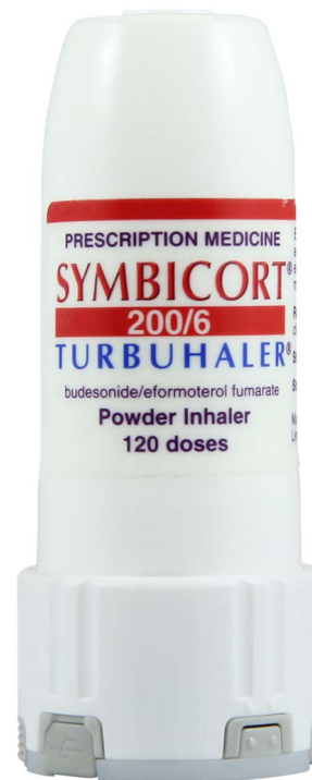
Figure 2 SmartTurbo monitor attached to Symbicort turbuhaler.

(n=3), 200/6 µg per actuation (n=12) and 400/12 µg/actuation (n=5)). Half of the turbuhalers had previous use, with counter displays showing that over half the number of available doses had been administered. The date and number of each actuation were recorded in the diary. The time of each of the low-use actuations was recorded. The first and last of the eight high-use actuations had their times recorded, as well as the number of actuations that occurred between them (at a maximum of 20 s apart). The time was taken from the clock on the computer used for data upload from the monitors. This method was utilised to minimise the chance of investigator error affecting the interpretation of electronic actuation data. When a turbuhaler was inserted into or removed from a monitor, this was also recorded.