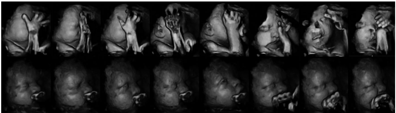
Figure 1 Illustrative 4D scan frames of a 32-week-old foetus of a smoking mother (top line) and a 32-week-old foetus of a nonsmoking mother (bottom line) over a 10-second period of observation.

where C_{it} are the event counts for foetus i at gestational age t , \lambda_{it} is the underlying Poisson rate, \beta_0 to \beta_7 are unknown