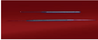
FIGURE 1: Illustration of the Feng Gou Zhen (sharp-hook needle).

acupuncture triggers the endogenous opium and cannabinoids system to release several pain-ameliorating substances to reduce pain [14, 15]. Therefore, many PAS patients resorted to acupuncture therapy in China and other foreign countries. Though studies reported that acupuncture is effective for PAS, the strength of evidence and its recommendation is still weak. According to a recent Cochrane systematic review, the effect of acupuncture for shoulder pain and its function improvement is still inconclusive. Current little evidence is unable to affirm or refute the effectiveness of acupuncture for PAS. It is of great importance to conduct a clinical trial with rigorous methodology to assess acupuncture's effect.